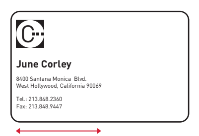
50% layout = 1,625 cards/roll*