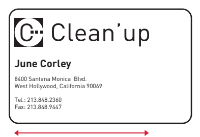
88% layout = 1,000 cards/roll*